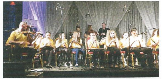
Portglenone CCÉ Group audience

The festivities ended on Saturday night with the singing session held in The Men Shed where singers from far and wide joined local vocalists in a wide medley of song well into the night.