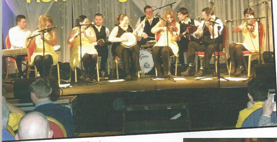
Knockmore Céilí Band

2014 All Ireland Céilí Band Champions, Knockmore Céilí Band, were the star attraction at a concert in The Riverside Suite at The Wild Duck Inn in Portglenone on Friday night. Hosted by the local Portglenone Comhaltas Branch and supported by local acts, Portglenone CCÉ Junior Traditional musicians and Glenullen Scór na nÓg Set Dance group, the concert was a resounding success.